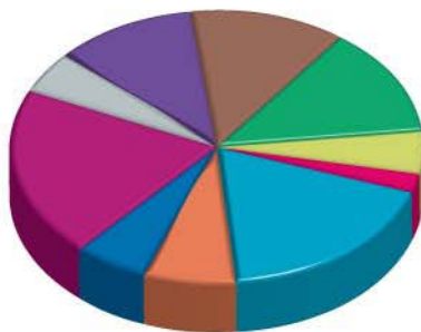
Hampton Roads Employment By Sector, March 2008